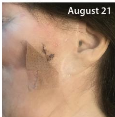
18 days later the Miracle Dressing fell off on its own....