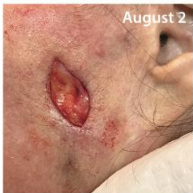
Elliptical excision of a basal cell carcinoma on her left cheek.

An 80+ year old woman with an 1.5 x 3.5 cm elliptical lesion. Miracle Dressing was used to replace external stitches and eliminate any scarring.