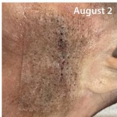
Miracle Dressing was applied.