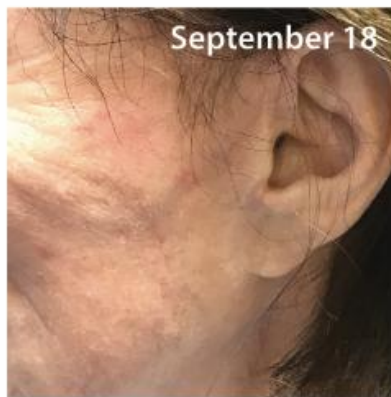
Only 28 days after removal of Miracle Dressing, the wound is virtually invisible.