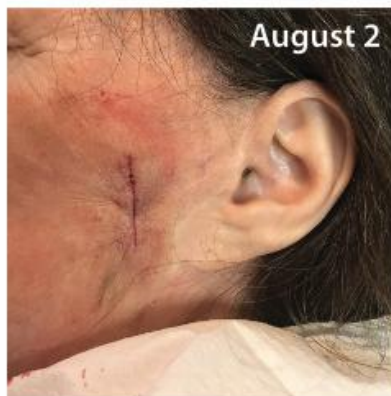
Undermining and deep Dexon absorbable sutures placed to close the wound.