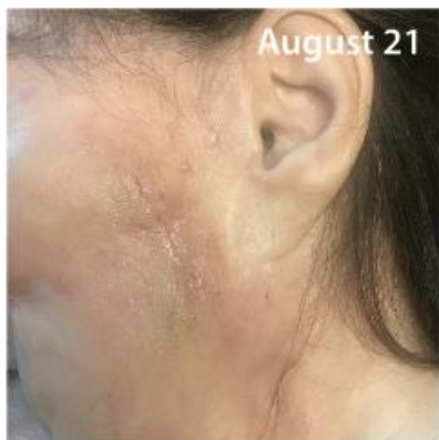
...leaving a completely healed wound without external stitch wounds.